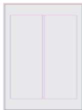
Full page 216mm x 292mm including bleed