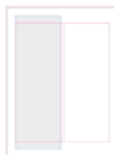
Half page vertical 85mm x 255mm