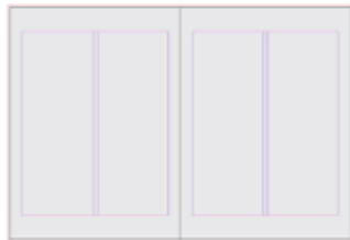
DPS 432mm x 292mm including bleed

Note: All bleed pages must have a 3mm bleed on all sides. Type and important subject matter should be kept at least 8mm from the trim on all sides.